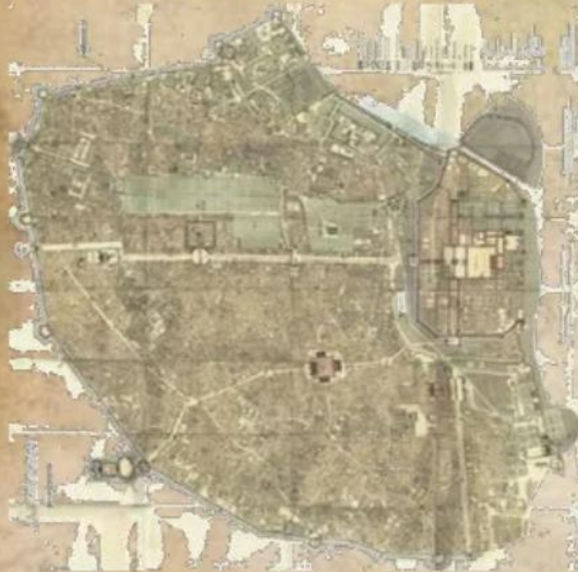
16th CENTURY: original shahjahanabad