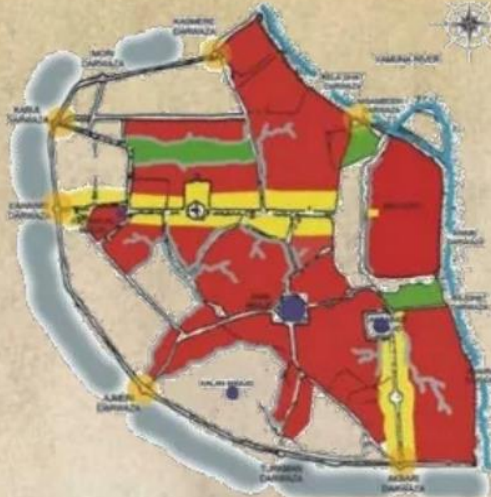
17th CENTURY: settlements