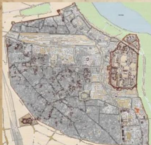
21st CENTURY: present condition