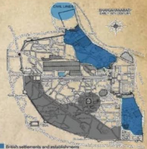
■ British settlements and establishments. ■ Extent of Middle Class settlements.