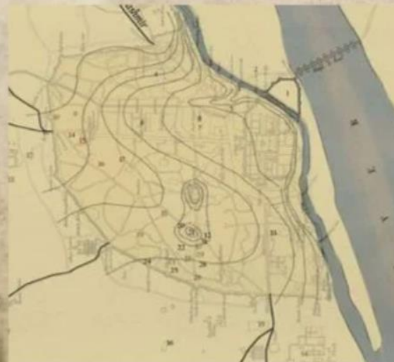
NATURAL FEATURES ON SITE